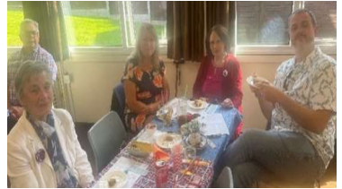
Residents enjoyed Afternoon Tea and the chance to join in with some games