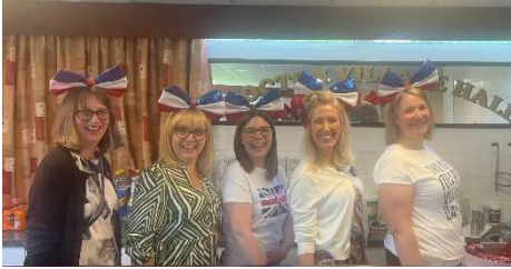
Brocton Land Girls??

The joint Parish Council and Village Hall Committee event was a big success with a good turnout from the village, see photos below: